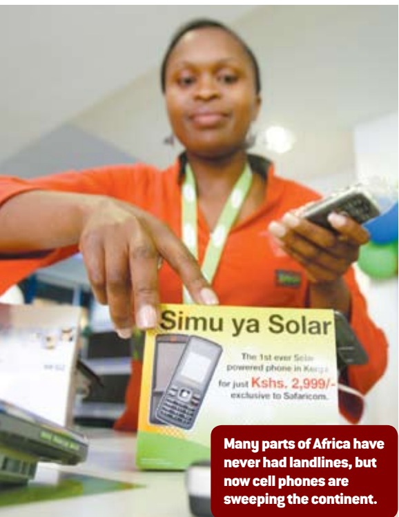
Many parts of Africa have never had landlines, but now cell phones are sweeping the continent.