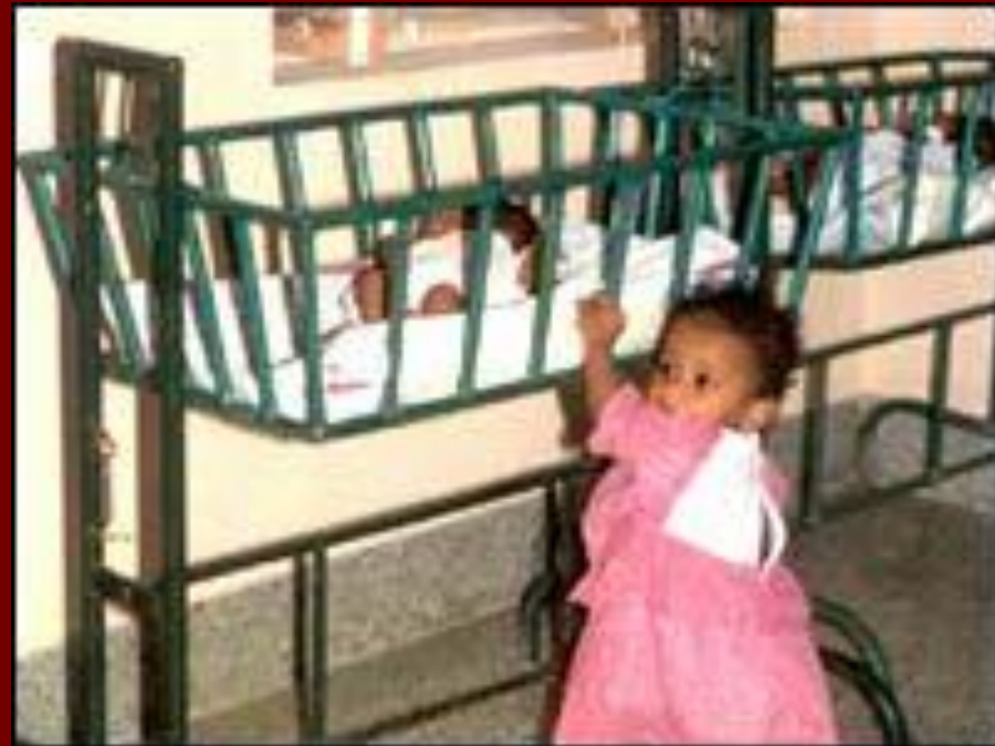
Abandoned babes at the ICCW orphanage in Usilampatti