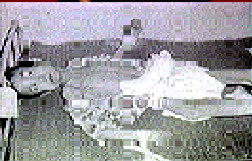
This boy spent four years in an orphanage before dying at age 11