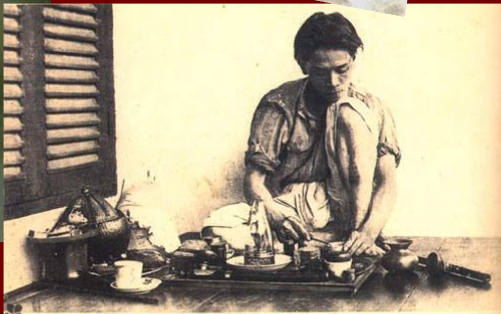
75. - Préparation d'une Pipe d'opium