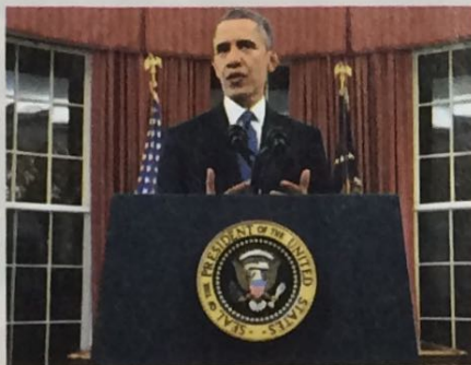
President Obama speaking to the nation from the Oval Office in December

Obama said the U.S. would intensify airstrikes against ISIS in Syria and Iraq and reassured Americans that the growing