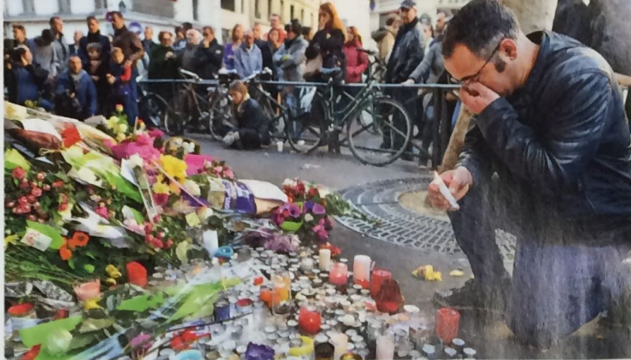
Mourning the victims of the ISIS terrorist attacks in Paris; 130 people were killed.

Years of costly U.S.-led wars in Iraq and Afghanistan have left many Americans wary of getting stuck in another conflict. Although President Obama has refused to send ground troops to Syria, he authorized