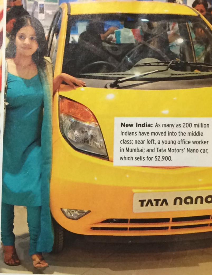
New India: As many as 200 million Indians have moved into the middle class; near left, a young office worker in Mumbai; and Tata Motors' Nano car, which sells for $2,900.